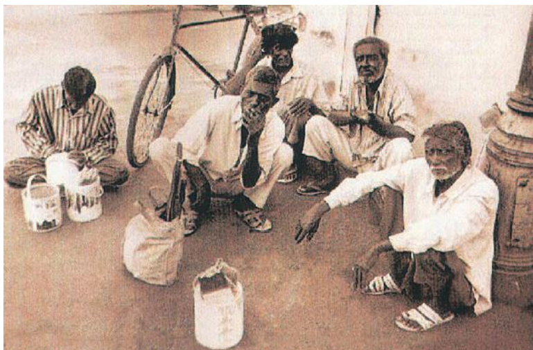
At labour chowk, daily wage workers wait with their tools for people to come and take them for work.

construction sites, lift loads or unload trucks in the market, dig pipelines and telephone cables and also build roads. There are thousands of such casual workers in the city.